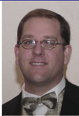
2011 Commodore Kevin Carroll

Although we have a 12 month sailing season, for many VYC Members the real season starts in May ! As our weather gets warmer we definitely see more people on the water. As you prep your boats for the busy season we should all pay close attention to the safety equipment, check those flares, fire extinguisher's and other safety equipment. The recent tragic sailboat accident serves as a reminder to all of us on safety issues.